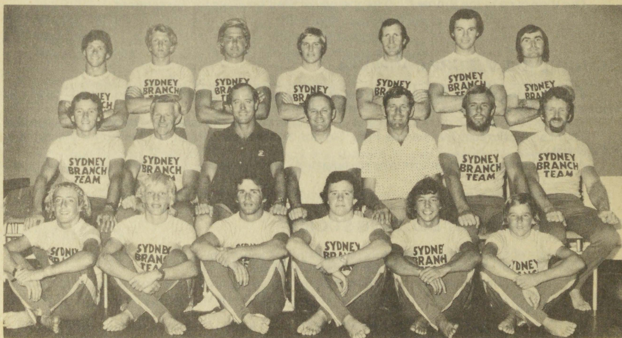
Sydney Branch Team 1976. Inter-Cities Champions (3rd year).