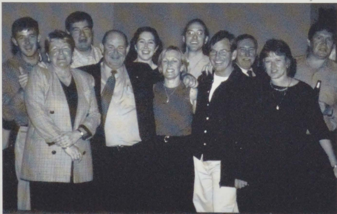
Burning Palms at the Presentation Night

Burning Palms won the Patrol Efficiency competition in the District and is indicative of the dedication of our active members. Eleven members gained their 100% patrol efficiency. Some members of the management committee not only take on and perform their duties in the capacity as an officer of the Club but are also active members on the beach.