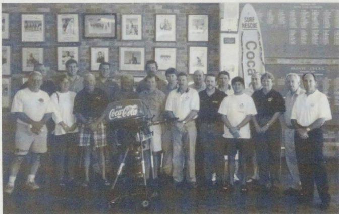
Coca-Cola and Club Representatives at the Coca-Cola Gear Grant Presentation – Bronte SLSC