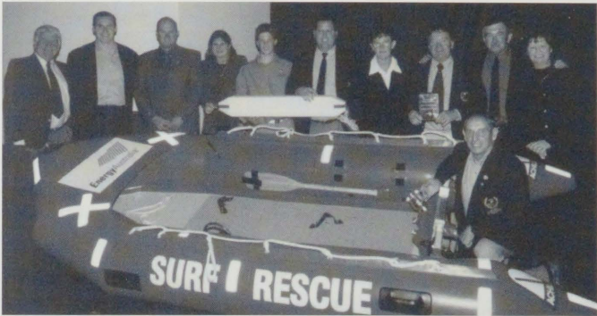
Wanda – Energy Australia Champion Club 2000

Wanda was the winner of this year's competition, gaining 58.5 points Burning Palms (55) were second and Bronte and Maroubra (52) were equal third. Wanda were awarded the Energy Australia IRB and Motor as their prize. The competition embraces administration, patrols, lifesaving, awards, Board of Control participation and open competition as part of the overall pointscore to determine the winner.