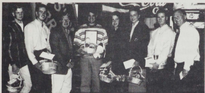
Finalists in the Sydney Branch Surf Life Saver of the Year