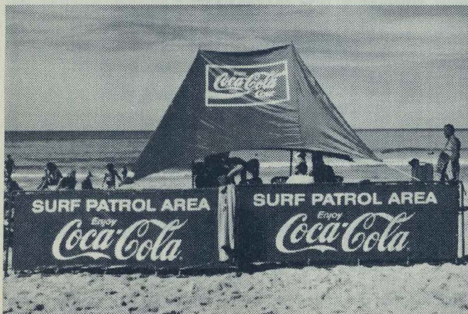
Coca-Cola Patrol tent and screens at Era Beach