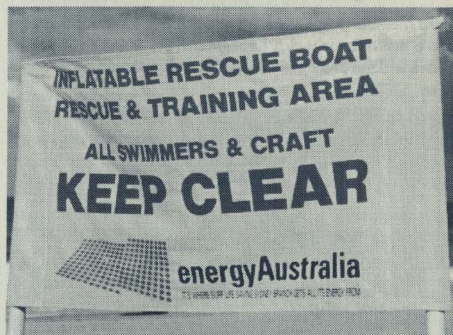
Board Major Sponsor - Energy Australia

A simple organisation structure of each Board is found further on in the Report, as is the basic job descriptions of the officers concerned.