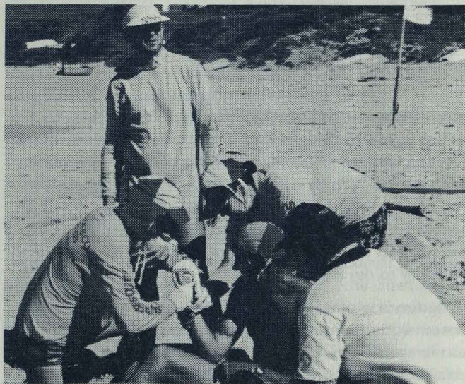
Club Patrol from Era taking part in Patrol Efficiency Competition Scenairo

The season started off with another successful gear inspection which took place on 13th and 14th September for all Sydney Branch Clubs and the Offshore boats were inspected on 20th September. I must say that the standard throughout the Branch was excellent. It was extremely difficult for the panel to come up with an ultimate winner, however, I am pleased to announce that Clovelly won the inspection with North Bondi coming a very close second. The inspection panel would also like to recognise Wanda and Maroubra for their excellent improvement from last season. There is a full report included in this Annual Report.