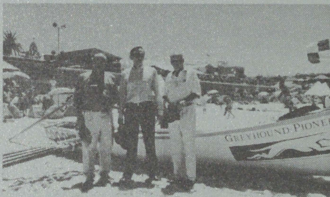
Premier Bob Carr (centre) at the Coogee Carnival