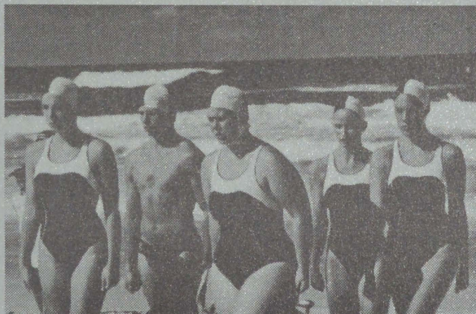
Under 16 Bondi R & R Team

In this our 93rd season, Bondi continues to be a mecca for locals and tourist alike. We experienced good weather in the main, with corresponding large crowds, of which many do not have any surf awareness skills or refuse to take due care, which continues to place a strain on our voluntary resources. Unfortunately we had one drowning during patrol hours outside the flagged area.