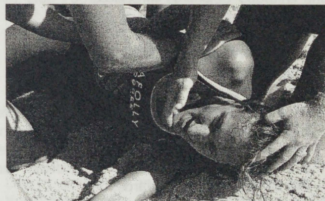
Coogee Training Resuscitation