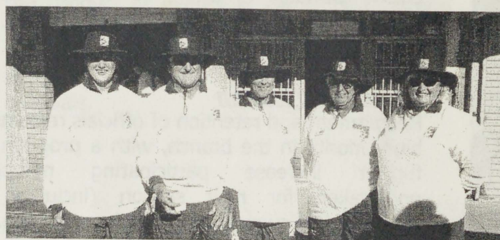
Sydney Branch Officials in their new Energy Australia Sponsored Clothing