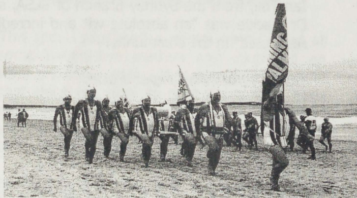
Branch Championship March Past Winners Burning Palms SLSC

The season kicked off with the competition Forum conducted at the Maroubra Seals Club in August. The event was well attended with representatives from most clubs in attendance. The discussion/contribution provided from club management, coaches, competitors and officials alike was first class! Ideas generated led to the trialing of several major initiatives in the conduct of events at carnivals. Club and individual feedback has been constructive and with some fine-tuning should advance to becoming standard operation for future carnivals.