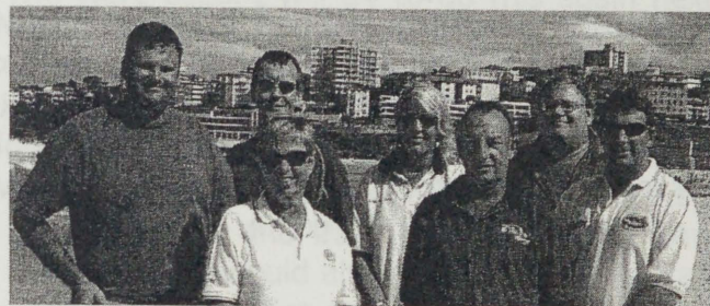
National Manual Revision Committee